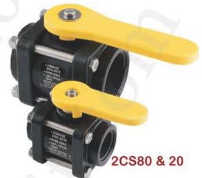
2CS80 & 20